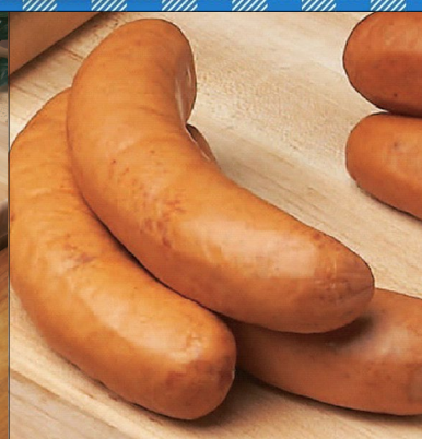
Bratwurst, Thueringer Smoked Product # KC354 • Size 10 lb. case

This is a great way to celebrate the season and try all of these great selections! The case includes 2 lbs. of each of the following: Bavarian Bratwurst, Coarse Bratwurst, Debreziner, Garlic Knackwurst, German Farmers, Coarse Liver/Landjaeger, Nuemberger Bratwurst, Pork Liver & Bacon Dumpling, Ring Bologna, Swiss Cheese Knockwurst, Thueringer and Weisswurst with Parsley.