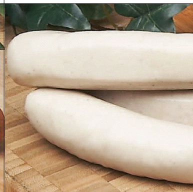
Weisswurst with Parsley, German Product # KC362 • Size 10 lb. case

This seasoned sausage is short and is infused with swiss cheese. This knockwurst is made from beef and pork stuffed in a pork casing, with just the right amount of spice.