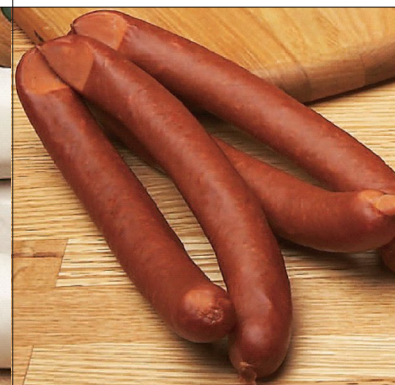
Bratwurst, Nuemberger Product # KC342 Size 10 lb. case

Weisswurst is a white German sausage. It is commonly flavored with parsley, onion, lemon, and cardamom. Typically it is prepared by boiling. It is great with mustard and pretzels.