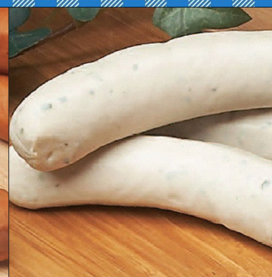
Bratwurst, Bavarian Product # KC282 • Size 10 lb. case

This sausage is made from finely minced pork and beef. Thueringer gets its distinct flavor profile from salt, pepper, caraway, marjoram, and garlic. Most commonly this sausage is prepared on a grill.