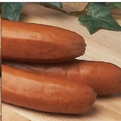
Knackwurst, Swiss Cheese Product # KC352 Size 10 lb. case

This garlic seasoned sausage is short and plump, produced from veal and pork stuffed in a pork casing, seasoned with garlic and lightly smoked.