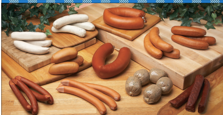
Oktoberfest Sausage Sampler Product # KF172 • Size 12 x 2 lb., 24 lb. case

This is a great way to celebrate the season and try all of these great selections! The case includes 2 lbs. of each of the following: Bavarian Bratwurst, Coarse Bratwurst, Debreziner, Garlic Knackwurst, German Farmers, Coarse Liver/Landjaeger, Nuemberger Bratwurst, Pork Liver & Bacon Dumpling, Ring Bologna, Swiss Cheese Knockwurst, Thueringer and Weisswurst with Parsley.